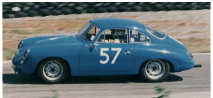
Jen McClelland in a 1964 Porsche 356 C at the Westwood Histories July 23 & 24, 1988