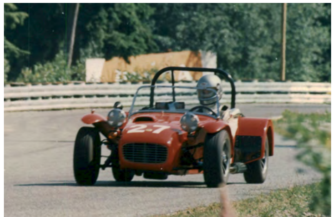
Phil Entwistle in his 1969 Lotus 7 at the Westwood Histories July 23 & 24, 1988

To place your classified ads, contact Stanton Guy ( webmaster@vrcbc.ca ).