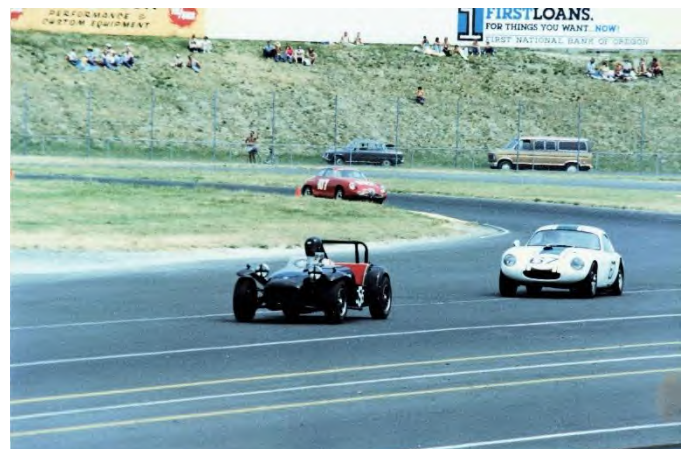
Lotus Elite Chassis #1182 (#67) Shown between two other cars racing at Portland International Raceway.