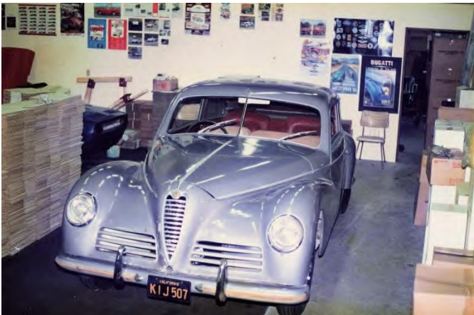
Alfa Romeo 6C 2500 Sport (California Plate KIJ 507)