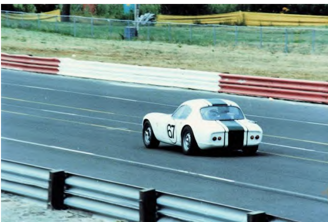
Lotus Elite Chassis #1182 (#67) at Portland International Raceway.