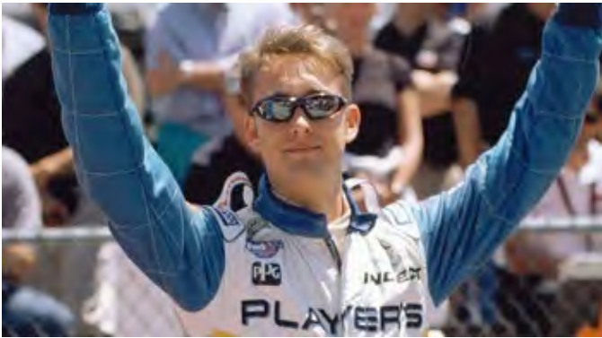
Greg Moore – BC Sports Hall of Fame photo.

2022 was also the first year that the Black Flag was no longer used to 'black flag all', and a red flag was used to inform all drivers to report to Pit Lane. This led to a lot of confusion for visitors and, at the beginning of the year, for many local drivers.