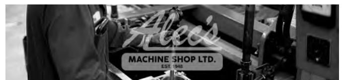
Alec's Machine Shop Ltd.

Burnaby, BC - engine rebuilds - contact Alec at (604) 876-7111 - https://alecsautomotive.com/